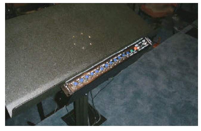
Photo showing a MyMix14 monitor box mounted to the bottom of a extra wide directors' music stand allowing the director to make changes to the monitor mix even while directing an orchestra or choir.

Photo showing a MyMix14 headphone monitor box mounted to the bottom of a tall music stand keeping the controls within easy reach whether standing or sitting while playing.