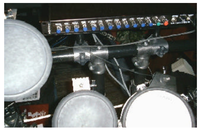
Photo showing a MyMix14 headphone monitor box mounted to the drum rack directly in front of the drummer again keeping the controls within easy reach to adjust the mix. Drummers like the low-end that acoutic drums provide. These electronic drums feature a "Subwoofer Shaker" mounted to the drum throne letting the drummer "feel" the low end thru the seat but not putting those low frequencies out into the house.

Photo showing a MyMix14 headphone monitor box mounted to the bottom of a music stand keeping the controls within easy reach for the electronic keyboard player to adjust the mix or mute the keyboard while setting up a blended patch of several MIDI modules thus hearing the sounds in the headphones but being muted in the house AND in all other monitor mixes including all MyMix14 boxes.