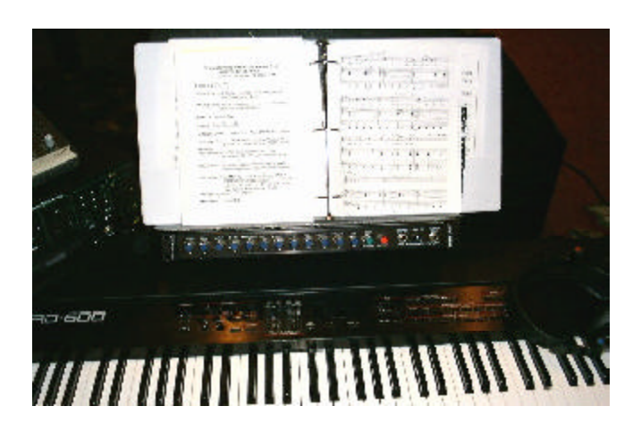
Photo showing a MyMix14 headphone monitor box mounted to the bottom of a music stand keeping the controls within easy reach for the electronic keyboard player to adjust the mix or mute the keyboard while setting up a blended patch of several MIDI modules thus hearing the sounds in the headphones but being muted in the house AND in all other monitor mixes including all MyMix14 boxes.

Photo showing a MyMix14 monitor box mounted to the bottom of a extra wide directors' music stand allowing the director to make changes to the monitor mix even while directing an orchestra or choir.