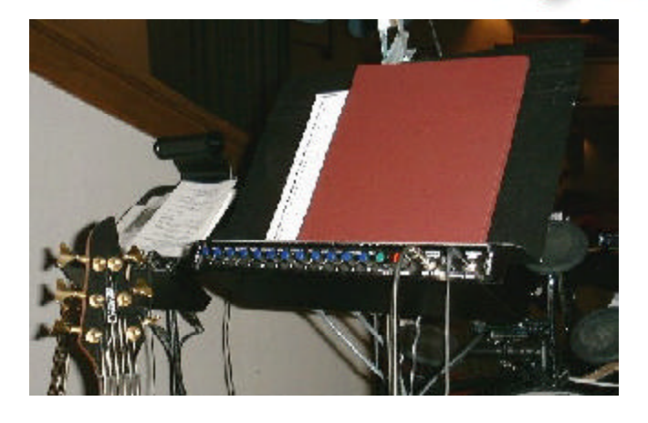
Photo showing a MyMix14 headphone monitor box mounted to the bottom of a tall music stand keeping the controls within easy reach whether standing or sitting while playing.